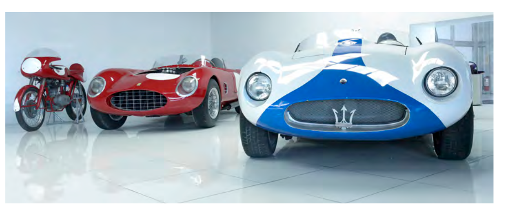
Neighborhood gains traction from Miami Supercar Rooms