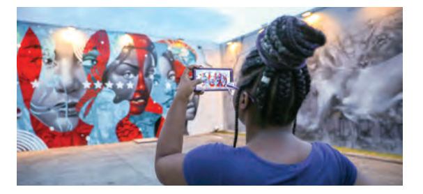
Warehouse walls provide home for curated street art. PAGES 8-9

SATURDAY, AUGUST 10, 2019 · NATIONAL ASSOCIATION OF BLACK JOURNALISTS · www.nabjmonitor.com/2019