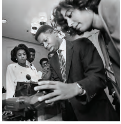
Students produce news for NABJ TV at the Los Angeles convention in August 1990.

ence so much that he applied for a second year with the project.