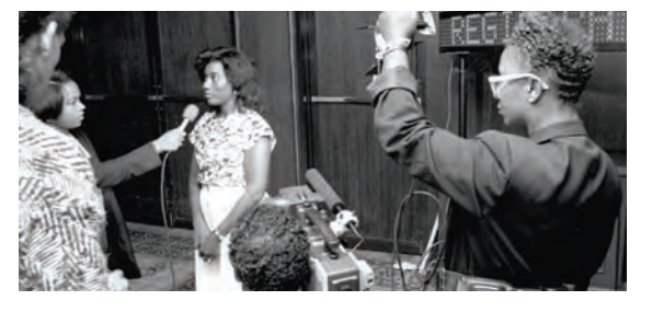
Student Projects marks 30 years of nurturing young talent. PAGE 6