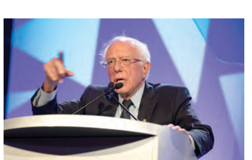
LEFT: Sen. Bernie Sanders addresses 2019 NABJ Convention in Miami. BELOW: Mayor Pete Buttigieg speaks with reporting students.