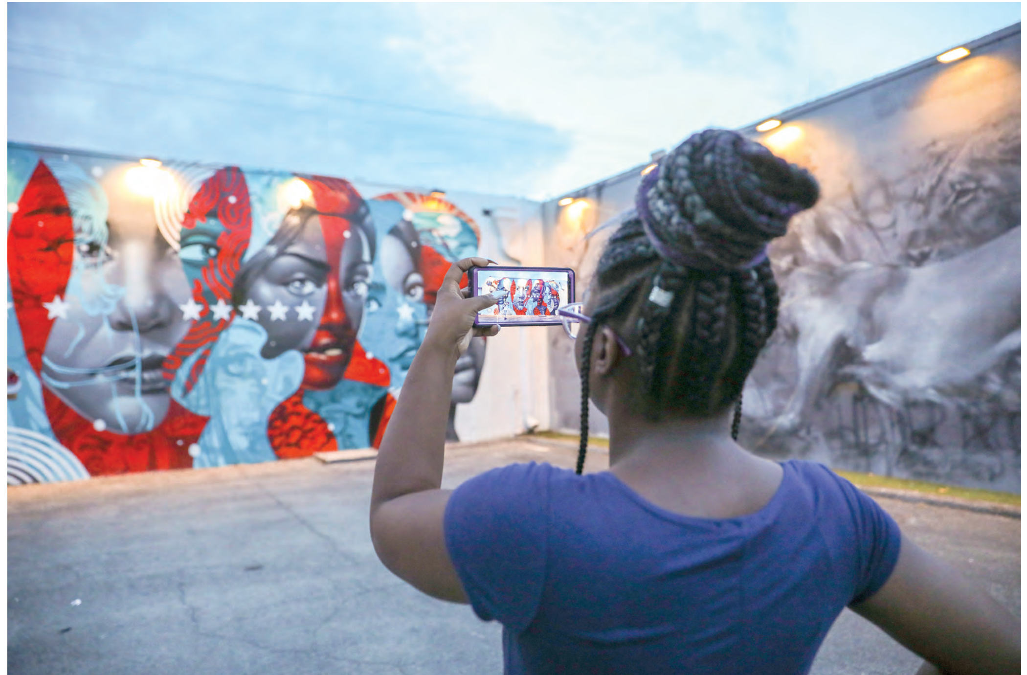
WAREHOUSE WALLS STORE A TREASURE

Wynwood neighborhood becomes canvas for street art